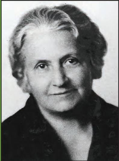
Dr. Maria Montessori, (1870–1952)

Developed by Dr. Maria Montessori, an Italian physician, educator and innovator, Montessori is a child-centered educational approach based on scientific observations of children from birth to adolescence.